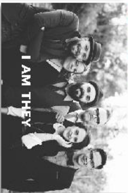
I AM THEY